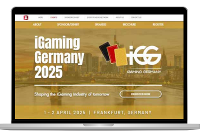
STEP 1: Visit www.eventus-international.com/igg and navigate to the registration section.

We have a variety of ticket options available. To find more info on these navigate to: www.eventus-international.com/igg