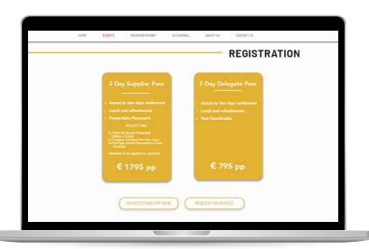
STEP 2: Select a payment method, either Card Payment or Invoice Request.