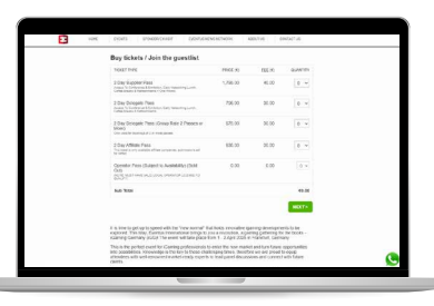
STEP 3: Select your ticket, fill in the form, and you're all done!